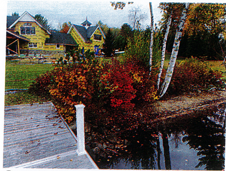
3 EXISTING SHORELINE - DOCK RIGHT Scale: 1:1600