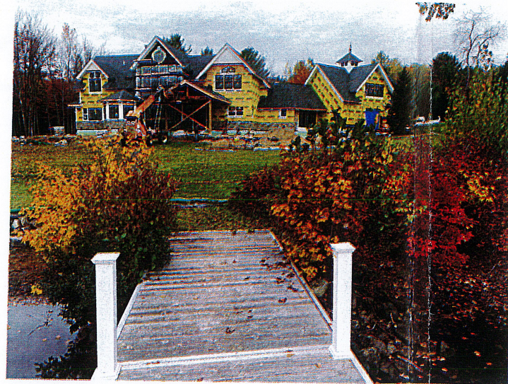
2 EXISTING SHORELINE - DOCK CENTER Scale: 1:1600