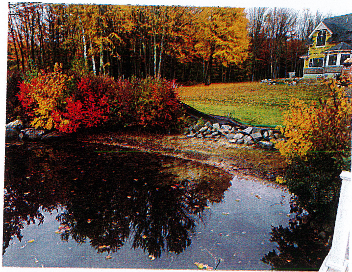
1 DOCK LEFT Scale: 1:1600